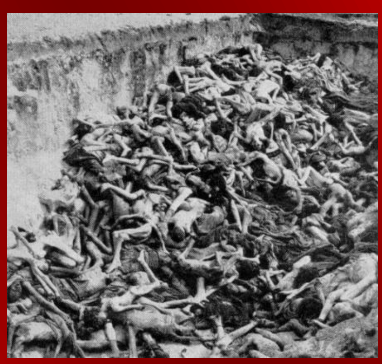
Will there be an attempt to exterminate the Anglo-Saxon-Keltic peoples?