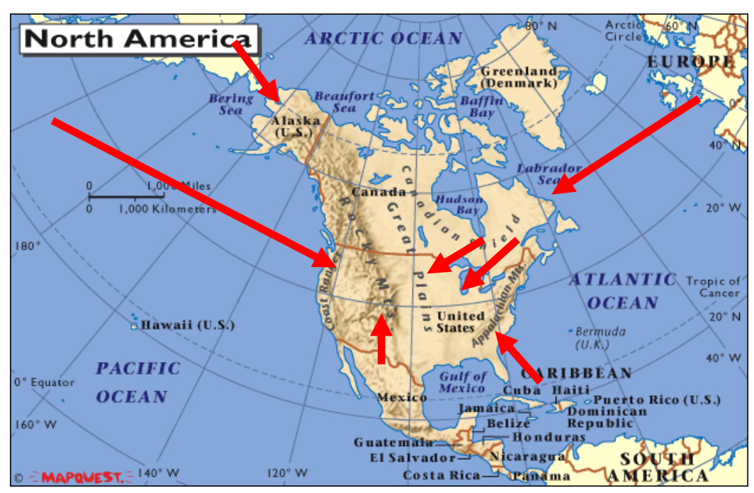
Beset on all sides - America will be ripe for invasion and captivity

Yet our liberal Anglo-Saxon leaders (political, banking, industrial) are blind. They think that they can build a world superstructure and a system which will guarantee free trade, individual freedoms and immorality, and the mixing of races and religions. Instead, the monster that they are assisting to create in the form of a European Union, will turn upon them in the biggest double-cross in world history. (see The Principality and Power of Europe ).