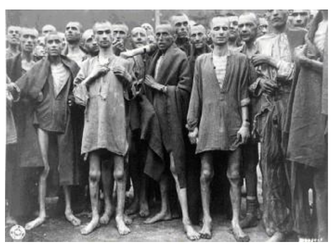
Could this happen again?

"The Lord God has sworn by His holiness, that, lo, the days shall come upon you, that He will take you [Israel] away with hooks, and your posterity with fishhooks" (Amos 4:2).