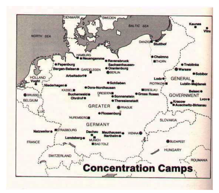
Map of death camps during WW2. Will death camps be a feature of WW3?

Notice, it is the rulers of Russia which shall marshal together the eastern hordes to attack and destroy Europe — Germany in particular (Zephaniah 2:13; Nahum 3:1-5; Micah 5:5-6; 7:12-13). With them is Kittim (Numbers 24:24; Daniel 11:30). Today Kittim dwells in northeast China! The final conflict will be at the famous Armageddon where the Beast's armies will be in its death throes with the East (Revelation 16:16). Here the powers of Assyrian — led Europe and the Russian-led Orient will temporarily form a truce to battle an invader from outer space — Jesus Christ. However, he will easily defeat them and slaughter anyone who dares exalt himself to stand in His way.