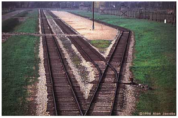
End of the line to Auschwitz - will it happen again?

[NB: this article assumes that the reader has some sort of WCG background and grasp of the Israel Message doctrine]