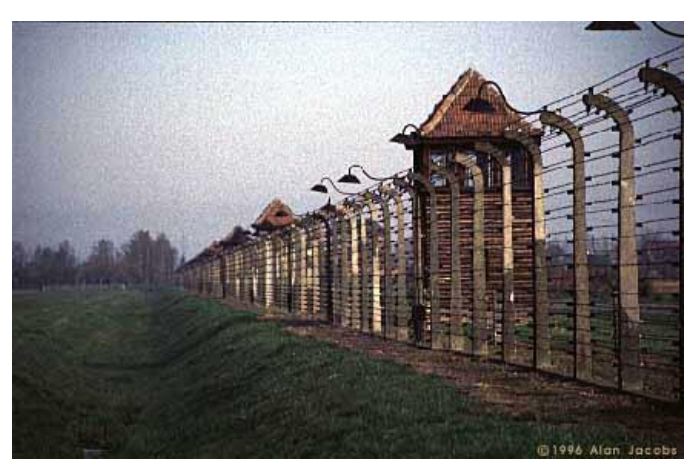
Birkenau - Nazi death camp

The above is quoted from Klaus P. Fischer's work, Nazi Germany: A New History.2