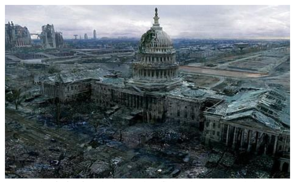
America is going to be devastated – unlikely as that may seem today!

May God grant us all the wisdom to understand exactly the nature of the Beast so that the elect will not be deceived into accepting this system and its religious ally as their hero standing up to globalism, liberalism and the various proposals for a New World Order.