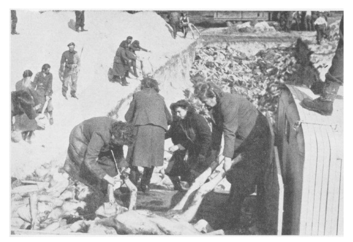
Why couldn't this happen again? Is it impossible or is it feasible?<sup>14</sup>